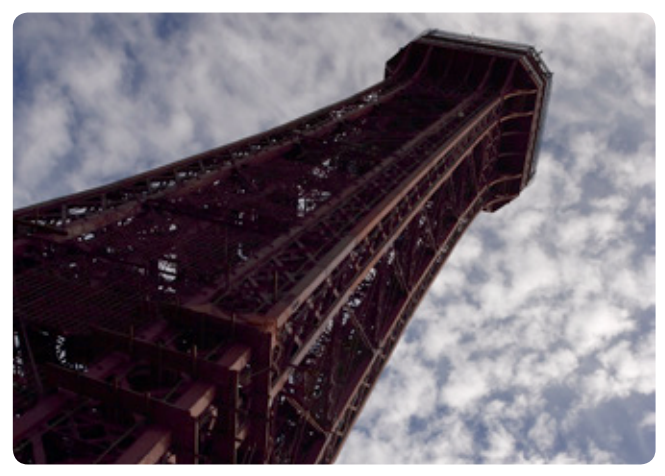
Biggest concentration of entertainment venues outside London