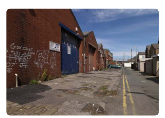
The worst male life expectancy in the Country