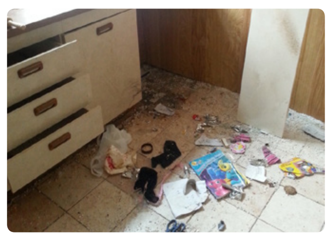
In some wards 50% of children currently live in poverty