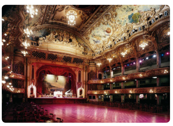
UK's leading seaside destination 12 million visits per year