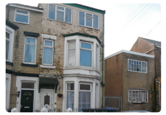
Blackpool has the highest number of HMO's in the Country